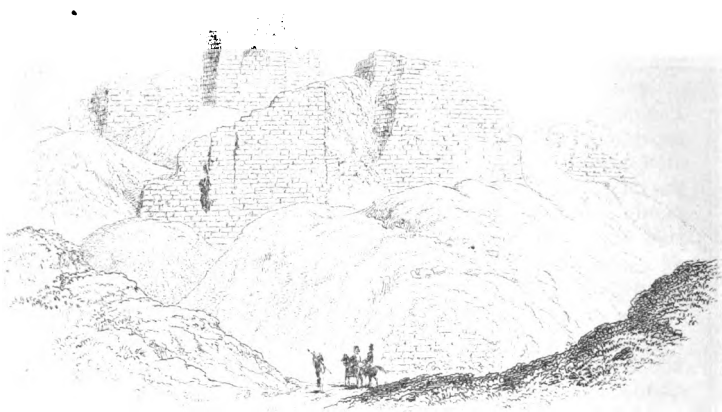
El Kasr western face.