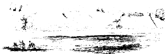
The Mjodibé western face.