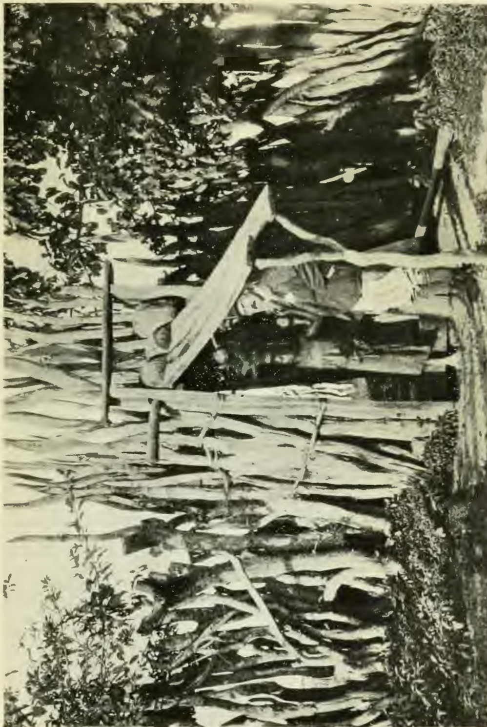
BIHÉ A village gateway in the stockade.