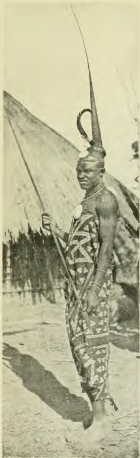
A STRIKING HEADDRESS A Mashukalumpe man. Near the Kafukwe River, upper N.W. Rhodesia.