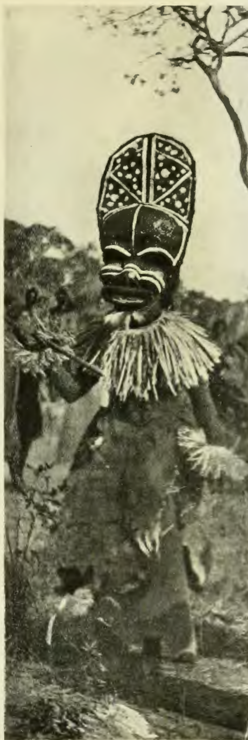
A FETISH MAN In a dress intended to represent a departed spirit.