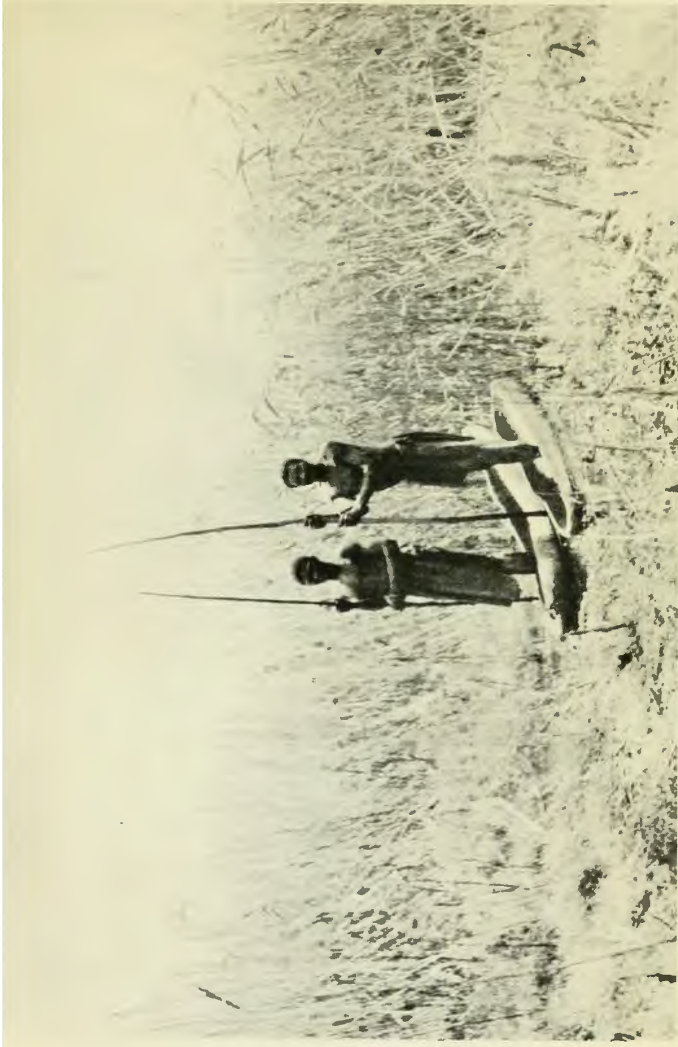
ON THE ZAMBESI. Natives pushing their canoes through the reeds.